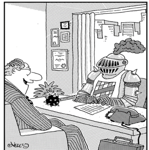
"Hey, no problem! I've always felt that a little sales resistance is a healthy thing!"